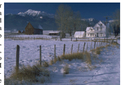
Winter does have it's own beauty.....and according to the groundhog it will happen

aged me to apply. I was stunned and a little frightened when the opportunity was, indeed, offered to me.